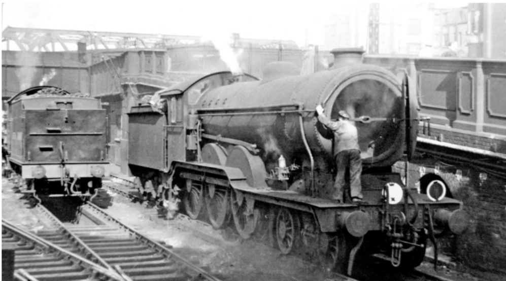
Figure 2 Locomotives at Liverpool Street Station, 1948

Undoubtedly, the steam phenomenon was replicated in Latin America as a way of opening to the new economic and social processes of the time. the accelerated pace of the railroad phenomenon caused that "Just 10 years after the installation in England of the first tracks on which a steam locomotive ran, concessions were granted in Mexico and Cuba to initiate projects of this type" (Kuntz, 2017, p.11). An event that marked the path of railroad gear in Latin America, leaving in evidence a safe and reliable way to look to the future (Figure 3).