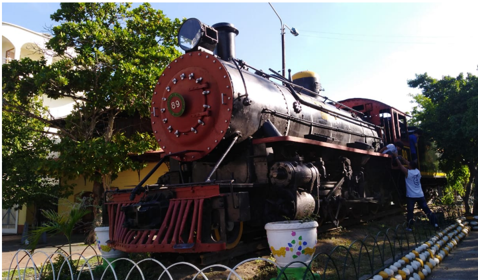
Figure 4, Skoda locomotive declared a National Monument, Source: Own elaboration (2020).

In that order of ideas, it can be highlighted that each territory and country in the world has different ways of telling the story, since their experiences and anecdotes are characterized by being unpublished and representative of their social and family environment. However, most of the fragments that make up the history of Colombia reflect that it has not been told by its witnesses, but through data, figures and purely official contents by governmental or specialized institutions at the national level that rule out the possibility of finding rigorous concepts within the stories told by their own protagonists.