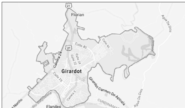
Figure 1 Map of Girardot, Cundinamarca, Colombia.

Girardot is a municipality of Cundinamarca located in the province of Alto Magdalena between Nariño, Tocaima, Flandes, Coello and Ricaurte, known for being one of the most important ports for the transportation of passengers and raw materials by rail, as it was connected to the department of Tolima and, in turn, had direct routes to La Dorada, Santa Marta and the capital of the country, Bogota.