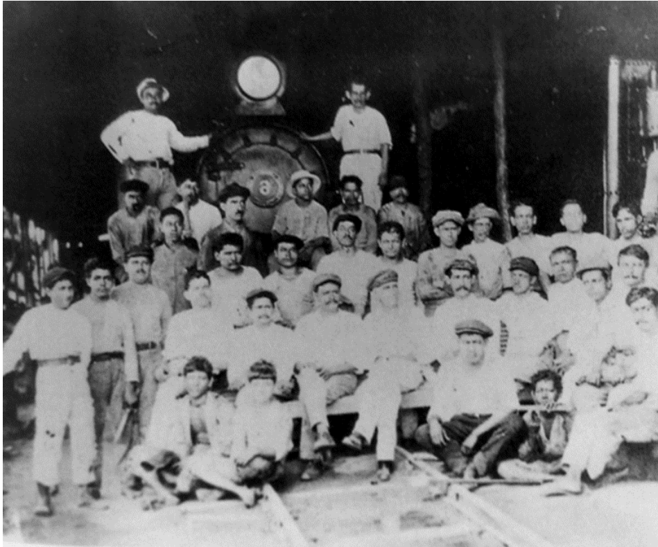
Figure 5 Girardot railroad workers, Source: Cubides and Sandoval (2017).

privileges political and war events, rescuing the great characters, the "notables". (p.91)