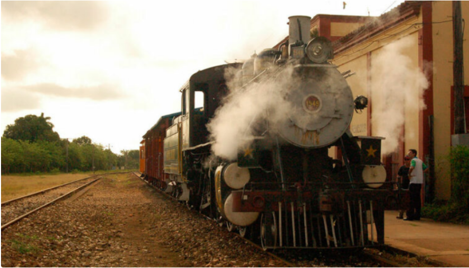
Figure 3 Current Havana Railroad, Cuba, Source: OnlineTours (2019).

Thus, the Cuban railroad is the first in Latin America and serves as a motivation for other countries: